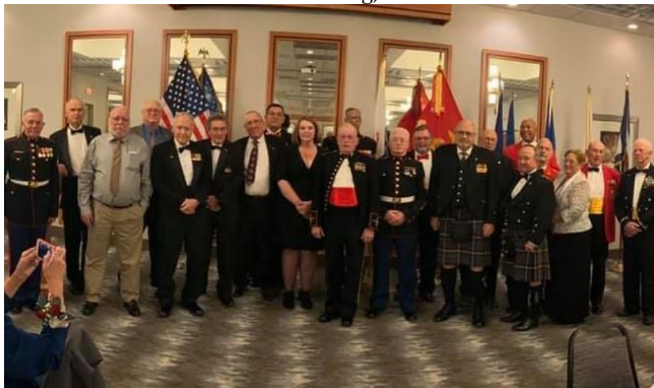
A couple of Marines wore the Leatherneck Tartan at last year's Ball