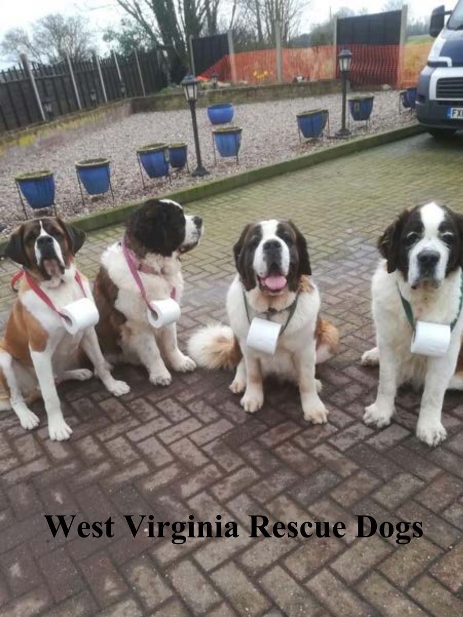
West Virginia Rescue Dogs